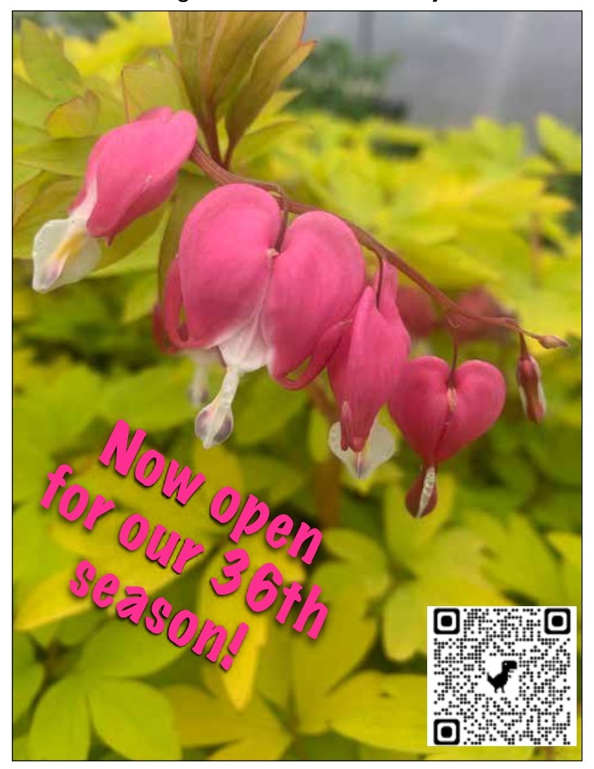
14 Mark's Lane (3kms north of the bypass on Redditt Road) Kenora, ON Phone 807–548–1325 www.debbiesgreenhouse.ca

We're Growing For You ... In More Ways Than One